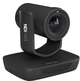
AMC-G330P/G320P AMC-NG330P/NG320P(NDI HX3)