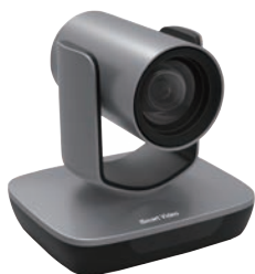
LTC5-A2001N LTC5-NA2001N(NDI HX)