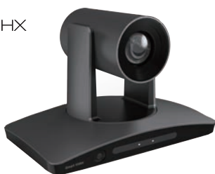
LTC2-A2001NV4/A1202NV4 LTC2-NA2001NV4(NDI HX)